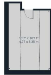
First Floor Building 2